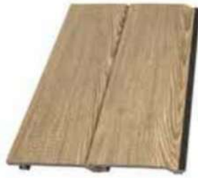
LMD 217 OAK