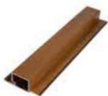
GOH2H GOLDEN OAK