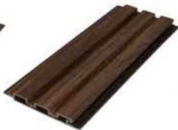
LMD726 PALACE WALNUT