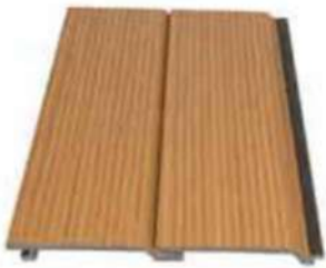
LMD 199 SPECIAL BAMBOO