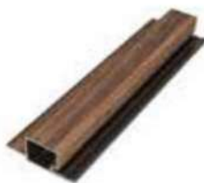
LMD726 PALACE WALNUT